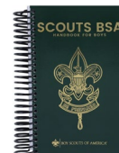
Scouts BSA for Boys