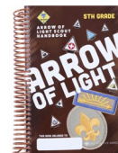
Arrow of Light