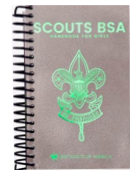
Scouts BSA for Girls